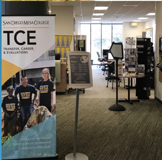
Mesa College Transfer Career and Evaluations Office

Located on the third floor of the Student Services Building 14-306