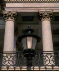
TURN ON YOUR LIGHT, AND LET IT SHINE BRIGHT